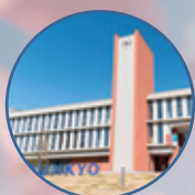
Tokyo Adachi Campus